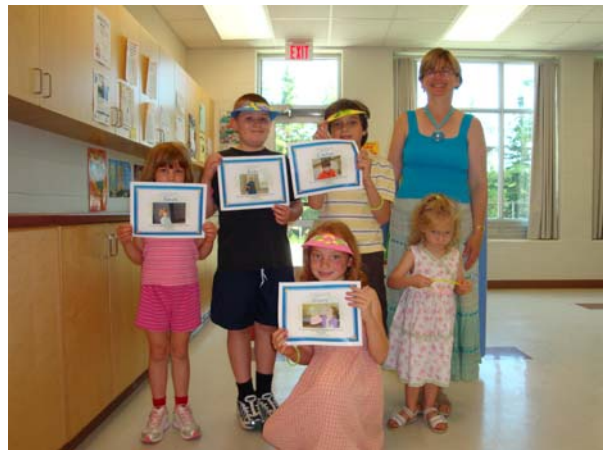
The students who were in attendance on the last Virtue Class of the year, show their graduation certificates.

Enjoy a safe and fun filled summer. Join us September 7 th for the next school year of Virtue Classes. Bring a friend.