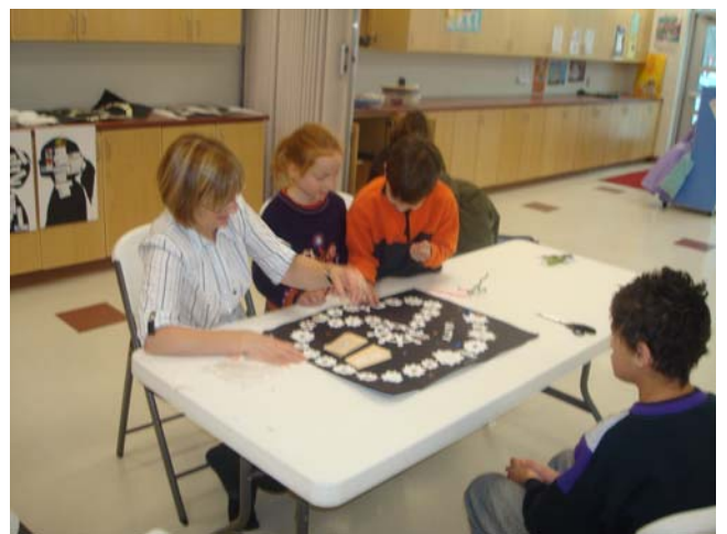
Participants show their understanding of this week's virtue, Trust, in playing the Signs of Success game.