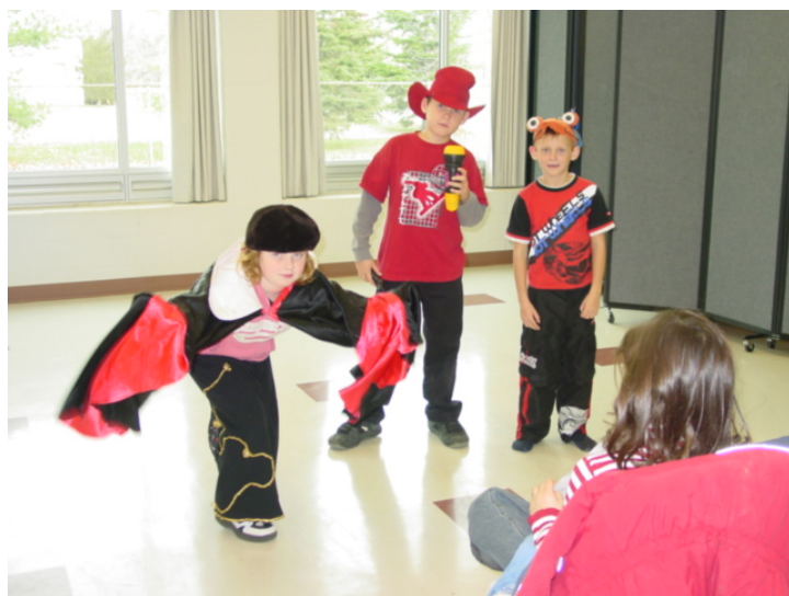
In the Hans Christian Anderson play, It's Absolutely True, we learn not to gossip.