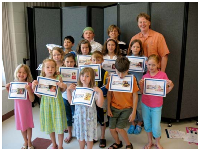
Virtues Class celebrates this year's graduation. We honour the children's Gifts of Character.

While answering questions about virtues the class receives pieces to make a commitment poster. "I am committed to developing my virtues."