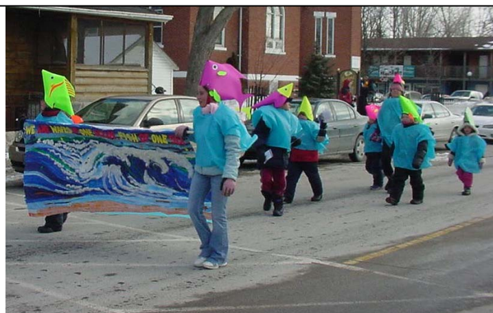
Do what you love and love what you do. The Virtues Class has fun sharing their message of unity in the Winter Carnival Parade.