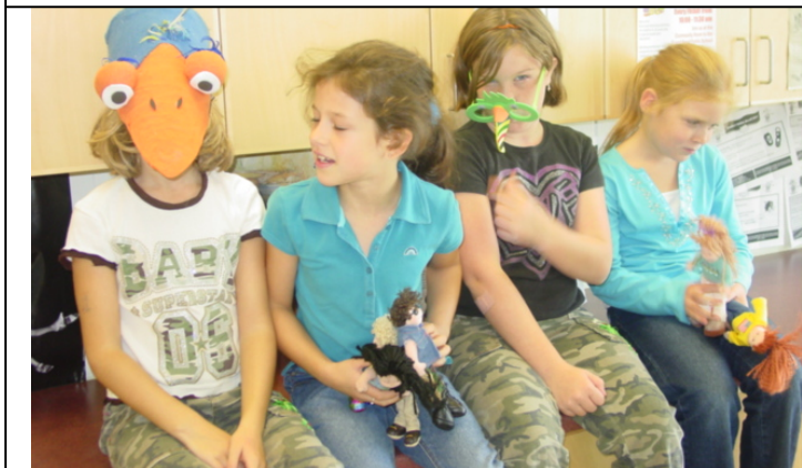
Two friends, who were afraid of cats, show courage when they rescue a baby bird from a cat.